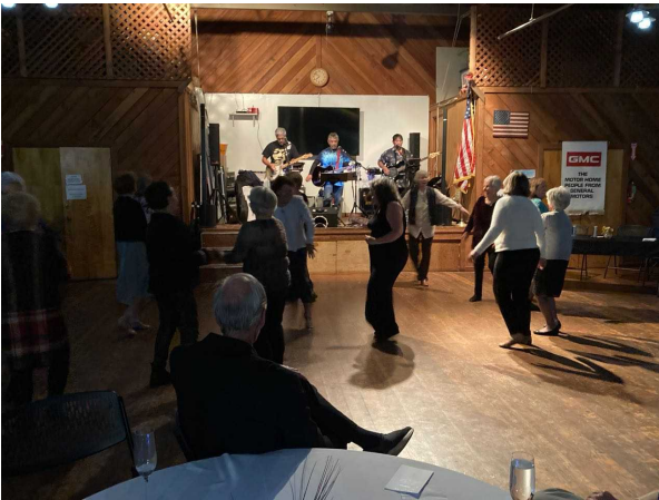
They Can Dance!