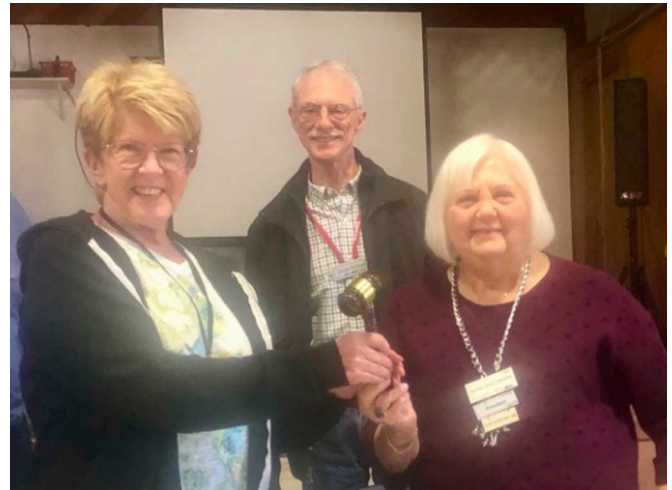
Who's the Bozo in the Background?