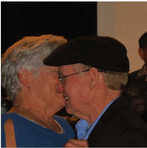
Love Birds—Thanks for the Great Rally