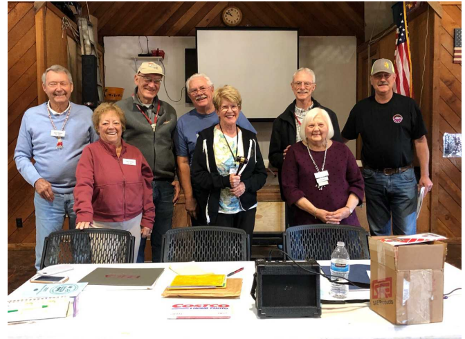
Old and New Officers