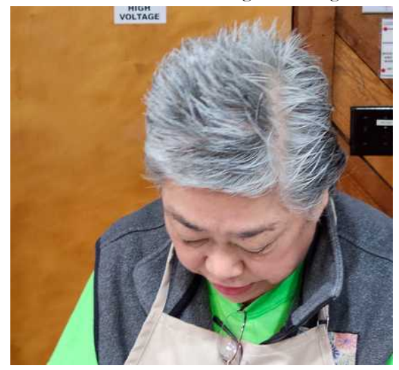
High Voltage Grace