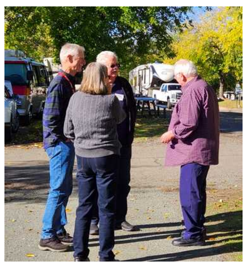
Got 15 MPG...