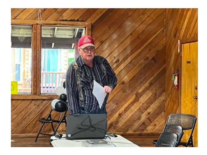
Doesn't Our New VP Look Official?