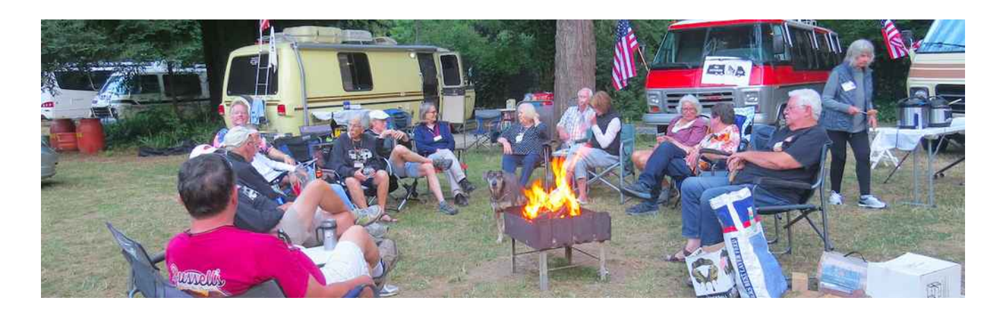
Wonderful Stories Were Told—Some True