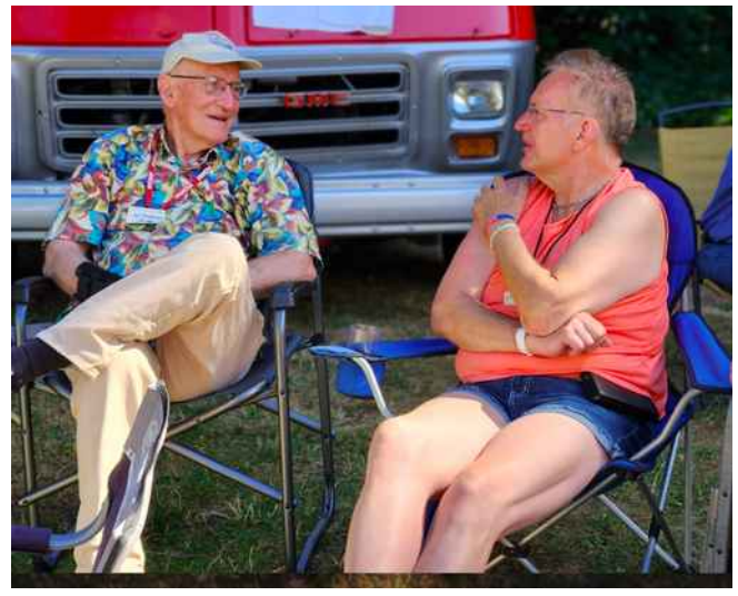
Well, I Got 17.78 Miles to the Gallon