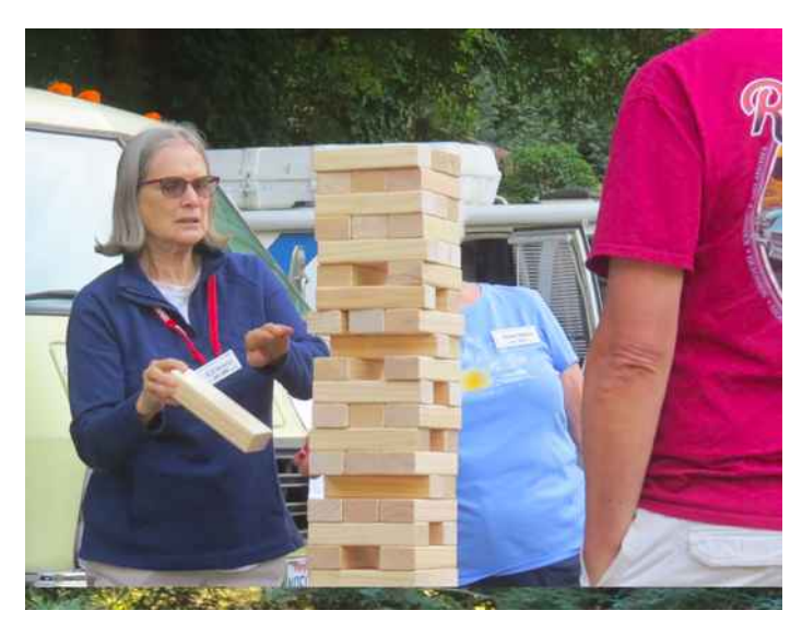
Concentration Easy, Now, Easy