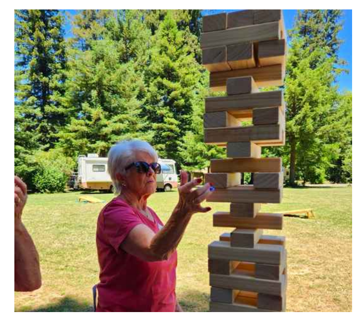
Oh, This Can't Miss