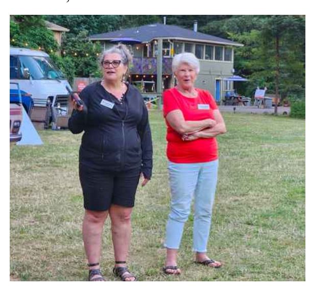
Dee, Do You Remember My Passcode?