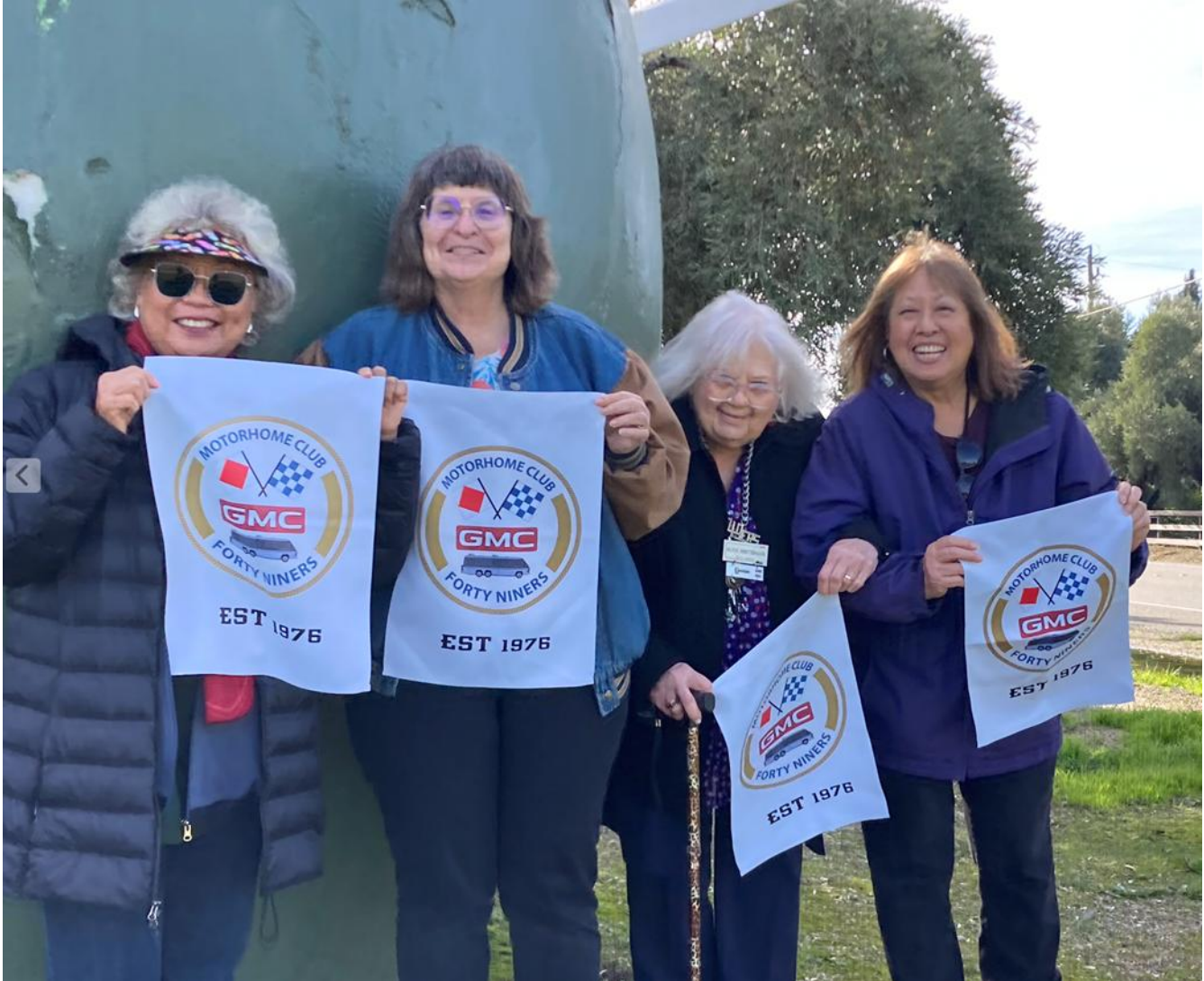
Showing off their new GMC 49ers flags at the Giant Olive.